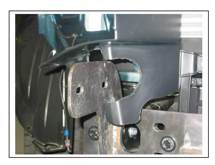
Figure 7: Drivers side air dam trim