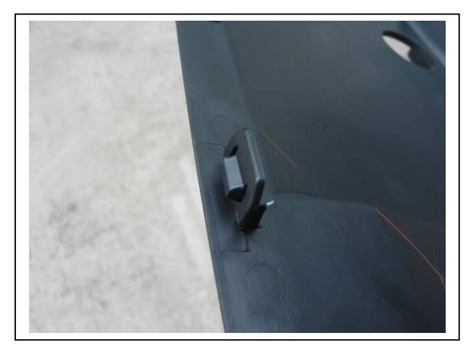
Figure 2: Clip on front of grille cover