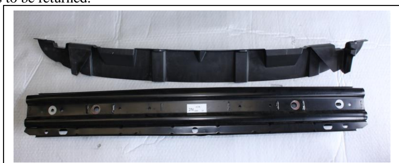
Figure 1 – Bumper support shown in two parts for photo

NOTE: During the installation of these products, the bumper support is removed. Please ensure bumper support is given to the vehicle owner and they are aware they will require to refitted if the product is removed. See figure 1 for photo of items to be returned.