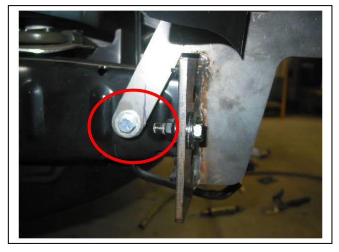
Figure 6: Rear bolt on ECB mount