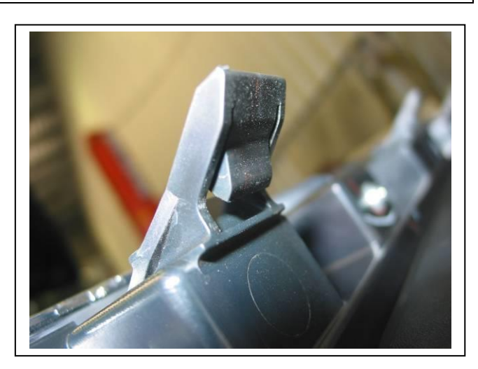
Figure 3: Clip on underside of grille