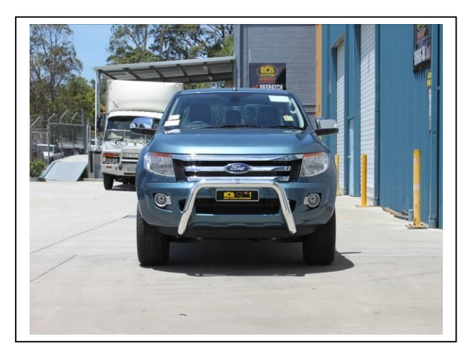
Figure 9: Nudge Bar front view