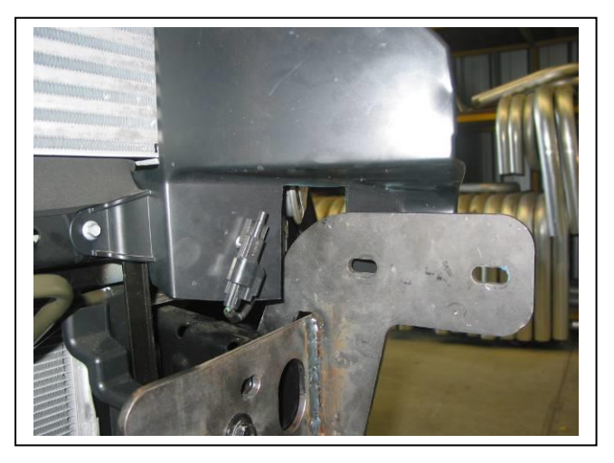
Figure 8: Drivers side air dam trim. Note: Air temp sensor refitted behind cut out.