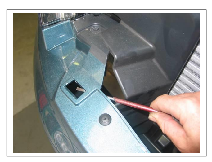
Figure 4: Position of clip with grille removed.