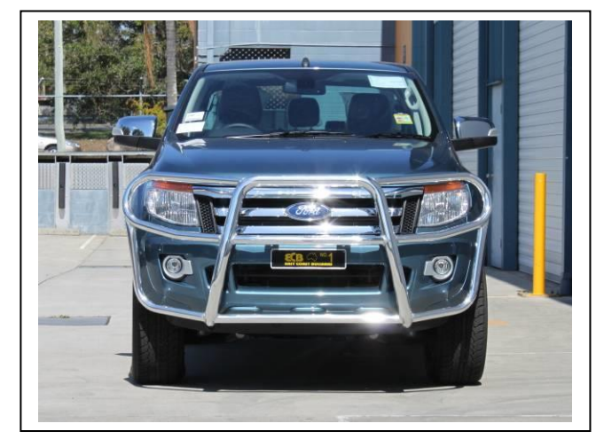
Figure 13: Type 8 front view