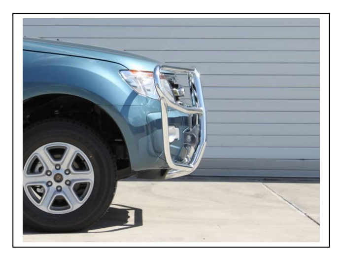
Figure 14: Type 8 side view