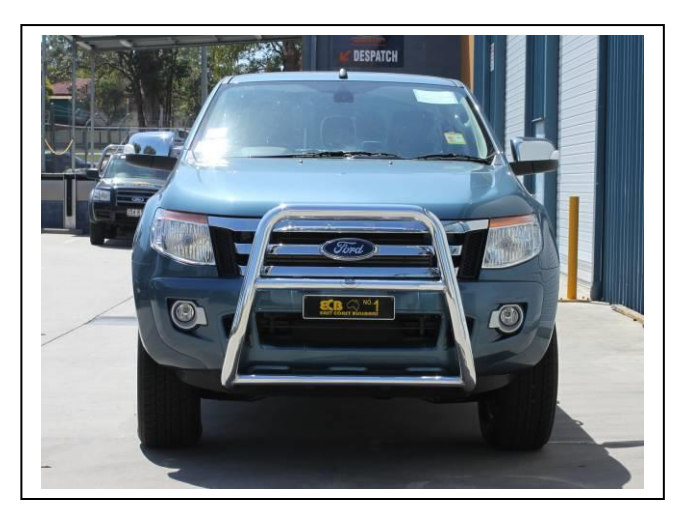
Figure 11: Series 2 Nudge Bar front view